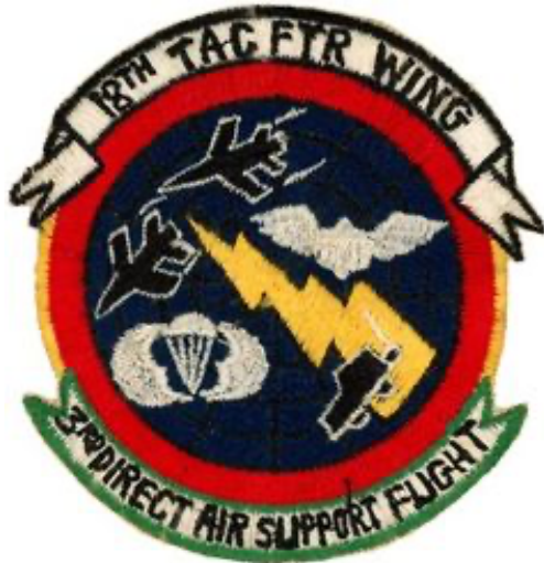
3 Direct Air Support Flight patch